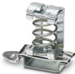
Shield connection terminal block, for applying the shield to busbars

Please be informed that the data shown in this PDF Document is generated from our Online Catalog. Please find the complete data in the user's documentation. Our General Terms of Use for Downloads are valid ( http://phoenixcontact.com/download )