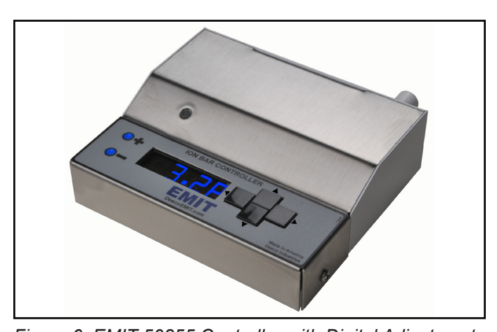
Figure 6. EMIT 50855 Controller with Digital Adjustment