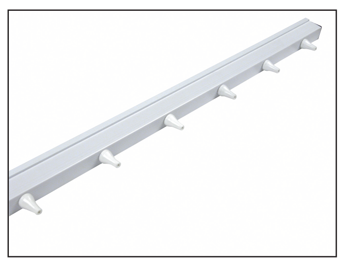
Figure 1. EMIT Air Assisted Ion Bar