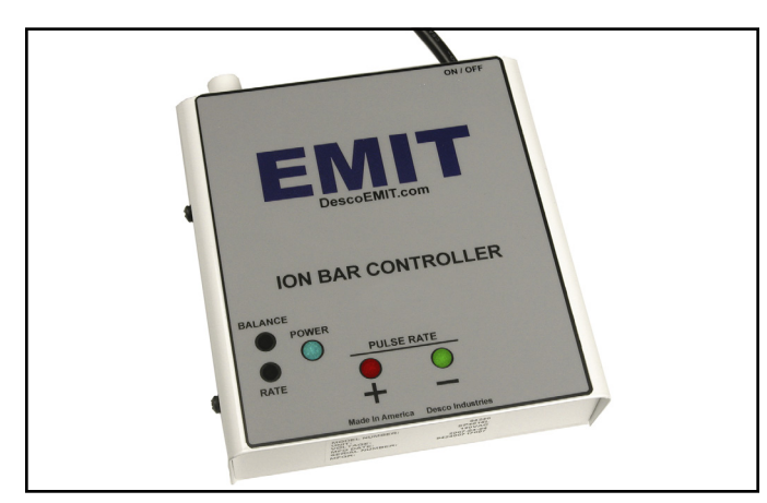
Figure 4. EMIT 50940 Controller with Recessed Potentiometer Adjustment